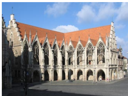
Old City Hall "Dornse"

Thanks to the international large-scale genome sequencing efforts, we now possess complete knowledge of the genetic codes of man and many model organisms. In this genomic era, traditional genetic and biochemical approaches are no longer sufficient to process or take advantage of the vast amount of DNA sequence information available. Complementary to systematic DNA mutagenesis and RNA interference studies, chemical compounds are particularly suited for genome-wide high-throughput experiments. This is because sophisticated technologies have been developed in the meantime for chemical ligand synthesis, screening and identification. With their help new biological targets and drug-like lead structures for therapeutic applications emerge. Small molecule driven biological research is currently rapidly evolving. We therefore want to discuss and evaluate front end topics of this field.