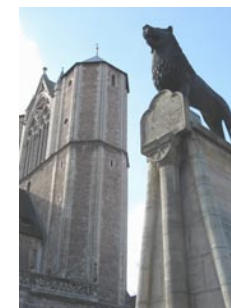
Lion monument at the Dom of Braunschweig